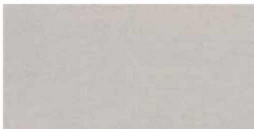
33,3 x 66,6 74798 Tan / ■105

Rivestimenti in pasta bianca White body wall tiles (ISO 13006 B III)