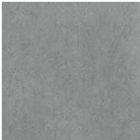
60 x 60 75074 Concept Coal pav. rett. / ■ 135

Pavimenti in gres fine porcellanato Fine porcelain stoneware tiles (ISO 13006 B Ia)