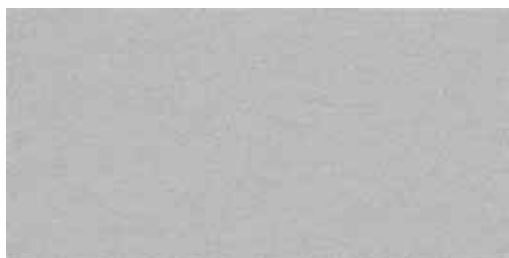
33,3 x 66,6 74797 Linen / ■ 105

Rivestimenti in pasta bianca White body wall tiles (ISO 13006 B III)