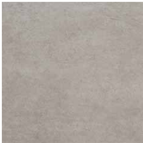
60 x 60 75072 Concept Toupe pav. rett. / ■135

Pavimenti in gres fine porcellanato Fine porcelain stoneware tiles (ISO 13006 B Ia)