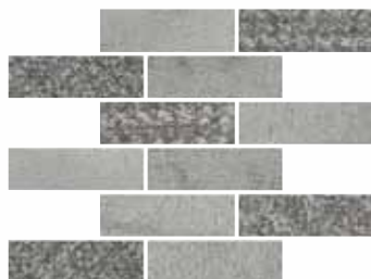
33,3 x 33,3 75082 Bricks Coal / ● 33