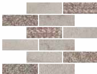
33,3 x 33,3 75081 Bricks Toupe / ●33