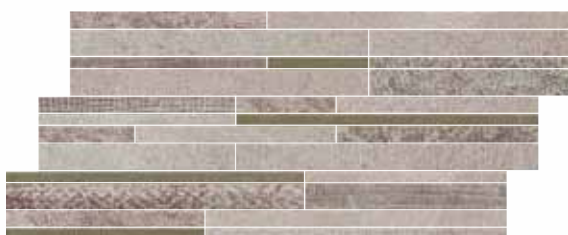
30 x 60 77851 Jaquard Toupe / ●163

Rivestimenti in pasta bianca White body wall tiles (ISO 13006 B III)