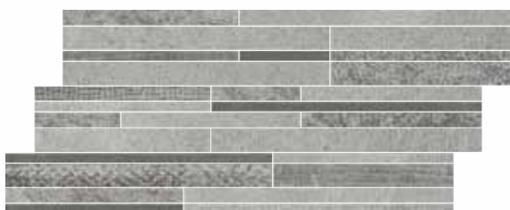
30 x 60 77853 Jaquard Coal / ● 163

Rivestimenti in pasta bianca White body wall tiles (ISO 13006 B III)